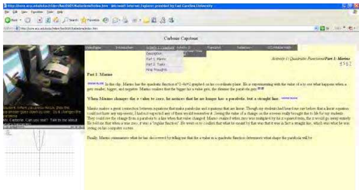
Figure 2. Example of a published video paper displayed in a web browser.

The VideoPaper author can add a number of features such as overlays, captions appearing in different colours for each speaker, hyperlinks to video and still images, pull down menus, and can hyperlink the page to outside sources that will open as new