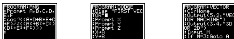
Figure 4. Different student programs for finding the angle between two vectors (initial screens only).