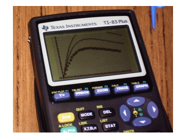
Figure 4. Group 1's graphs for goal widths of 5, 7.32 and 10m for a run line from near goal post of 10 m.

Groups 1 and 2 used their original equations and then changed the widths in the formula so they could graph the three functions showing size of shot angle versus distance along run line on their graphing calculator screen (Figure 4) to find where maximums were occurring and make comparisons. They recorded examples of the functions they had used with the exception of Ahmed who merely recorded goal mouth width, run line distance for maximum shot angle and size of the maximum angle for three specific cases. In addition, Ozzie showed where the changes in the algebraic model came from in the real context.