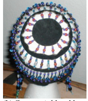
(b) Ceremonial headdress